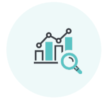
& much more